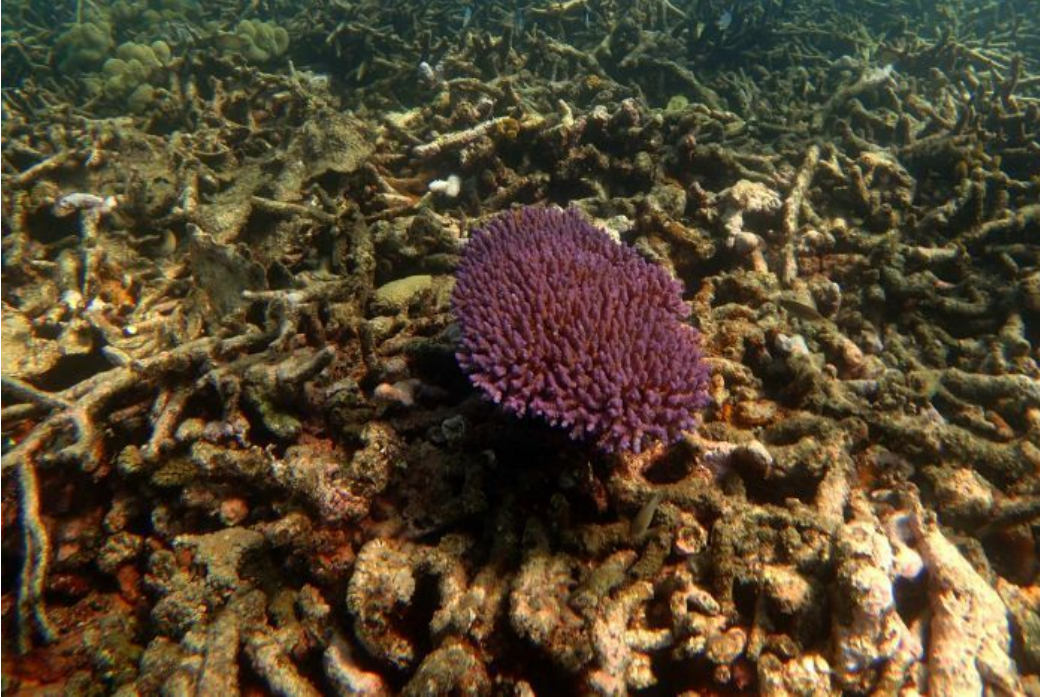
PHOTO: The Acropora tenuis found alive, surrounded by otherwise dead coral.

He said that was the worst-case scenario, if nothing urgent was done to address global ocean warming.