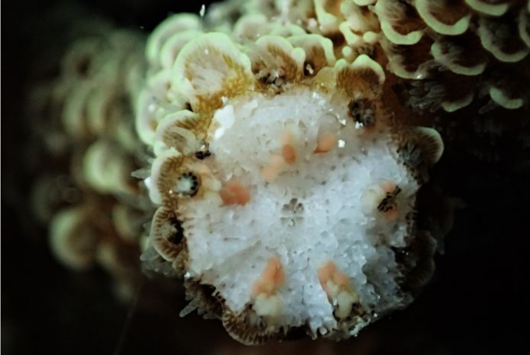
PHOTO: Eggs in the Acropora spathulata coral, ready for release when a rare second spawning event is due in December.