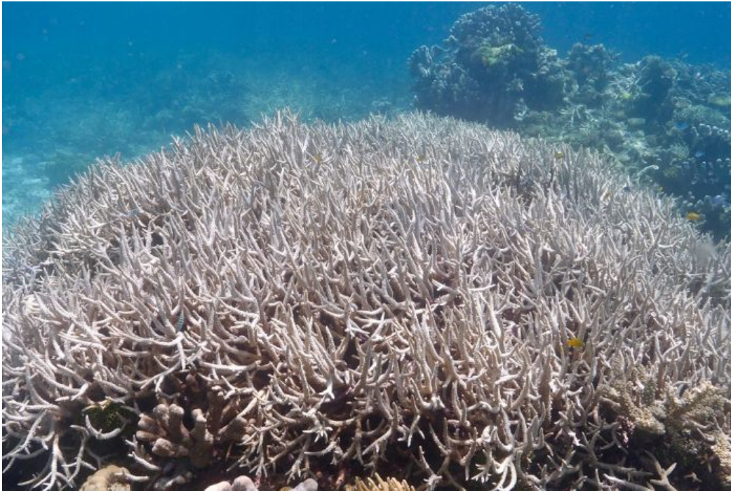
PHOTO: Bleached staghorn coral on the extreme northern reaches of the outer Great Barrier Reef. (Supplied: Zack Rago)

The discovery of such a diverse and healthy site was an anomaly during the expedition, which otherwise found devastating cases of mass coral bleaching.