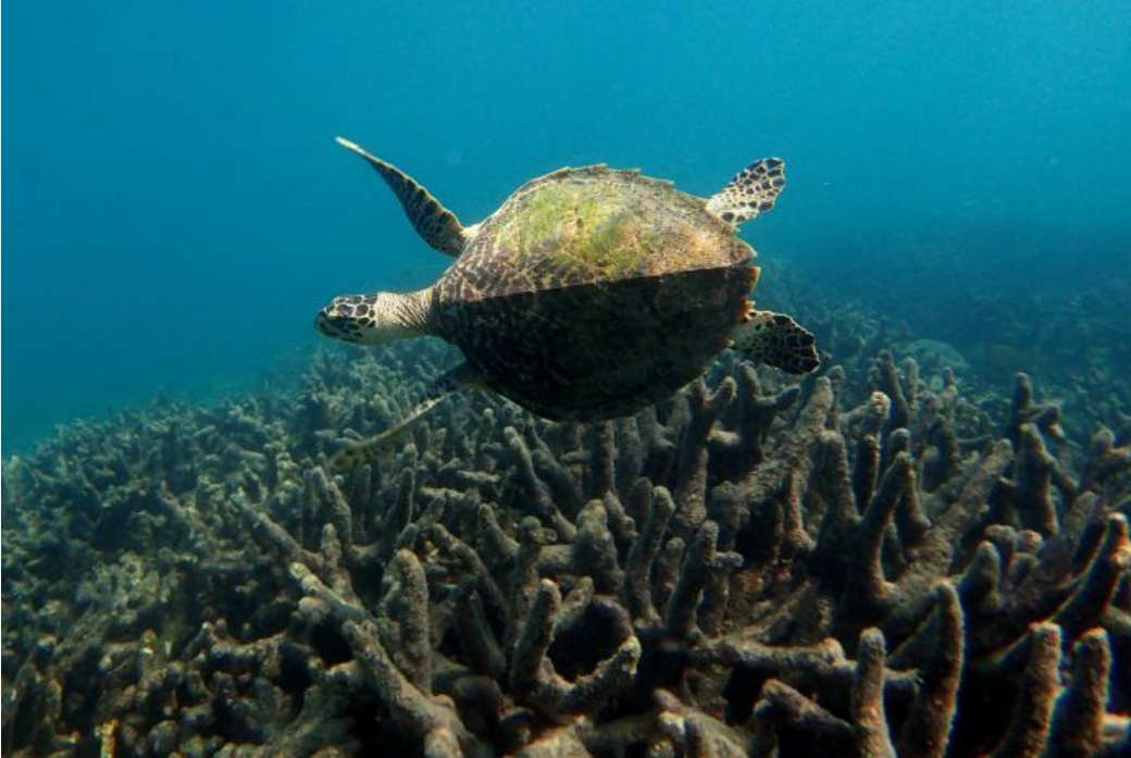
A turtle glides past an eerie forest of dead coral covered in algae on the Great Barrier Reef.

The 10 marine biologists and mapping experts on board the Legacy expedition included scientists from the University of Queensland, University of Technology Sydney, and the Australian Institute of Marine Science.